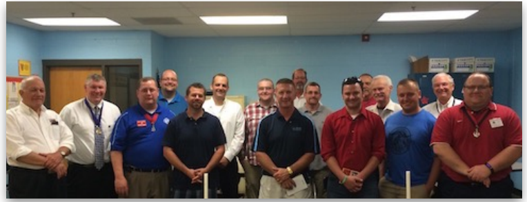
Council 12502 Independence