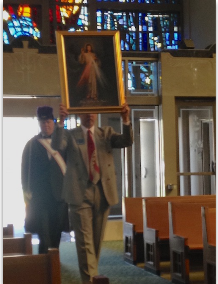
Council #14130 in Lexington celebrated Divine Mercy Sunday.