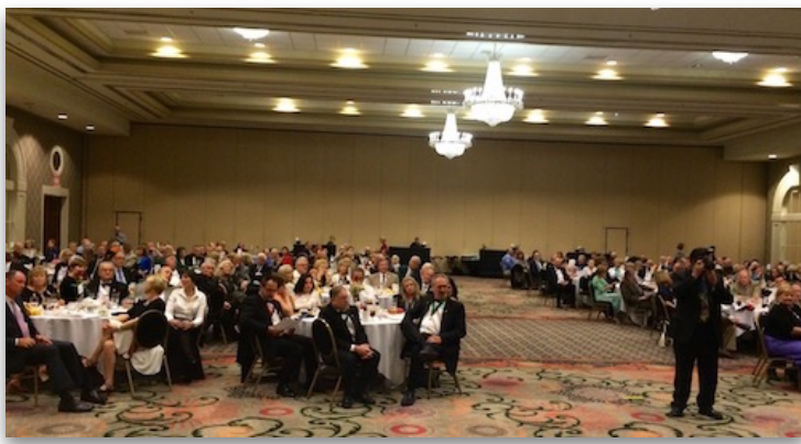
Council 2761 Bishop Spaulding Annual Derby Charity Dinner was well attended.