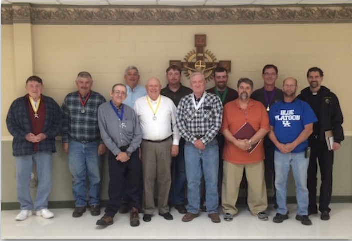
Council 2499 Hardinsburg normally awards two scholarships to graduating seniors each year. This year because of a special circumstance they added an additional scholarship.