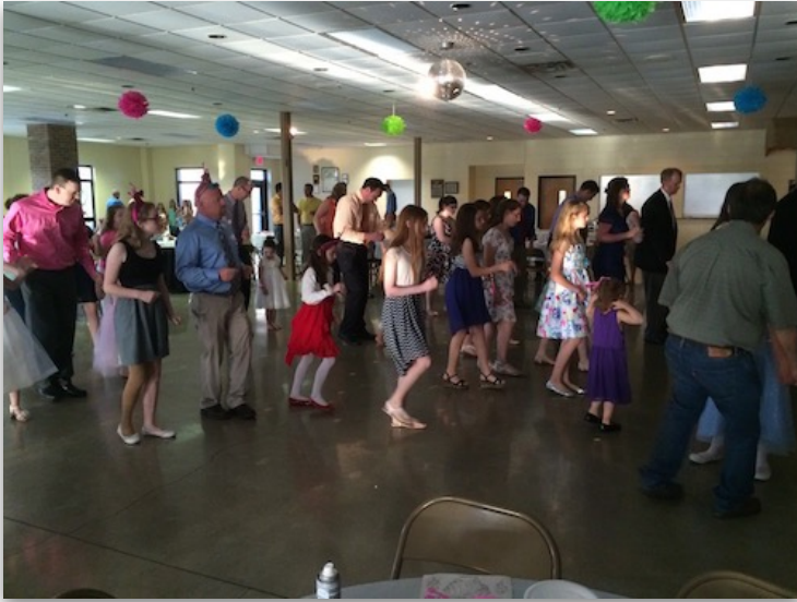
Dads and Daughters Prom held by McGivney Council 12502.