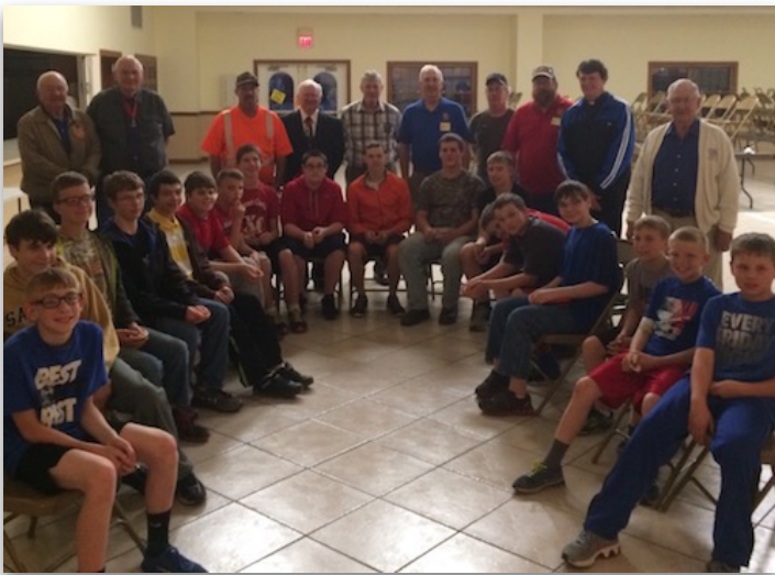
Council 7387 Hawesville reactivated its Squires Circle and brought in 18 new Squires.