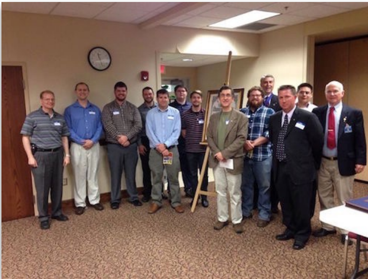
Council 14130 brought in 11 new Knights.