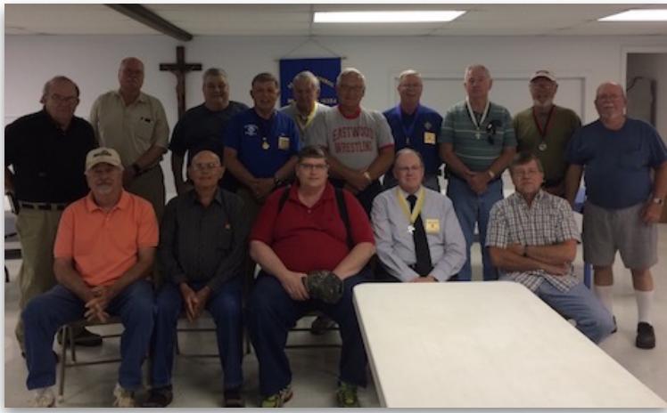
Council 12354 Mt. Washington