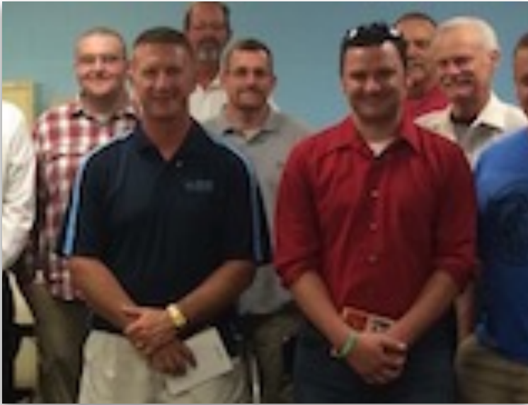
Council 12502 welcomes two new brothers into the KofC.